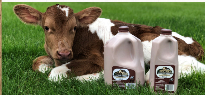
Golden Guernsey Calf

Served with one side vegetable & small ice cream